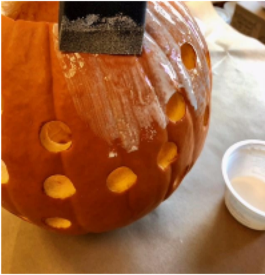
The size goes on milky white