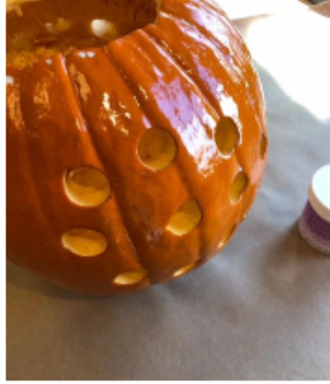
and turns clear as it reaches tack

Once you've prepared your pumpkin, load your foam brush and apply enough SGW Water-Based Size to leave a thin white coating all over the pumpkin. Rest the sized pumpkins on a jar lid. The SGW Size will quickly shift from milky white to glossy and clear (in about 20 minutes), then the pumpkin is ready to gild.