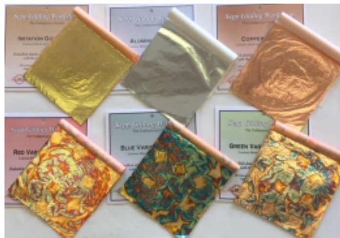
Sepp Gilding Workshop Leaf – Imitation Gold, Aluminum, Copper, and Red, Blue and Green Variegated

Sepp Gilding Workshop (SGW) also offers Gilding Kits with varying colors of leaf and primers, along with size, brush, stir stick and even gloves. SGW also offers Red, Yellow and Gray primers, and Imitation Gold, Aluminum, Variegated Red, Blue and Green Leaf separately.