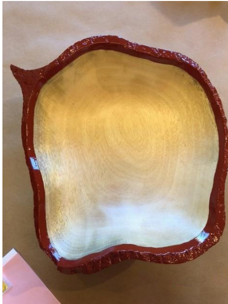
The size levels as it comes to tack and gets shinier

Typically, the size will come to tack in about an hour, and gives you about an hour to gild, but this varies with temperature and humidity. Periodically check the size. When ready to gild, the size should feel dry but tacky. If you press your knuckle to the surface it should come away with no residue.